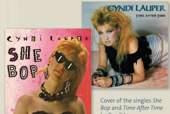
Cover of the singles She Bop and Time After Time by Cyndi Lauper.